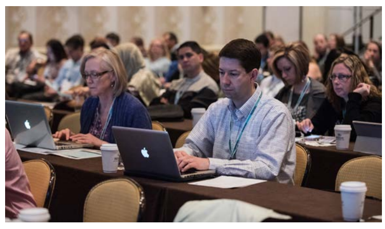
Please visit www.neoconference.com for up-to-date program changes.