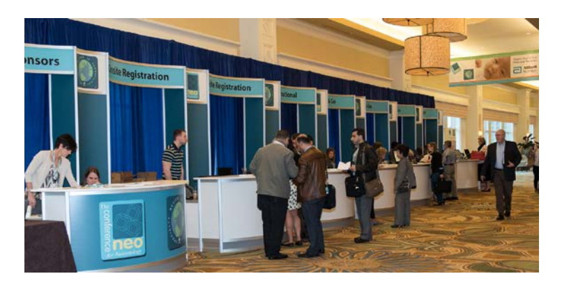
• Early Discount Rate: Until Dec 31, 2015