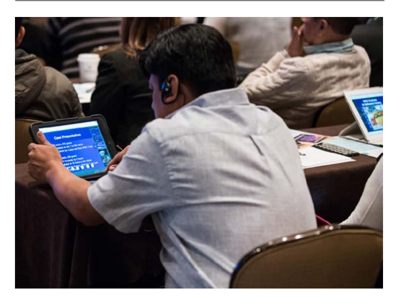
Please visit www.neoconference.com for up-to-date program changes.

6:00-8:00 pm - Welcome Reception & Exhibits