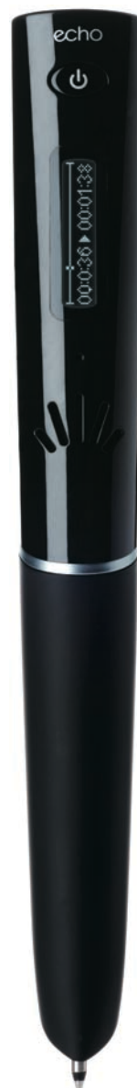
Actual size shown (6.22" x 0.78" at top; 0.45" at tip)

How: Start or change your free subscription to Neonatology Today from print to the PDF.